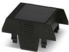
Component housing connection opening on one side, color: black, width: 45 mm

Please be informed that the data shown in this PDF Document is generated from our Online Catalog. Please find the complete data in the user's documentation. Our General Terms of Use for Downloads are valid ( http://phoenixcontact.com/download )