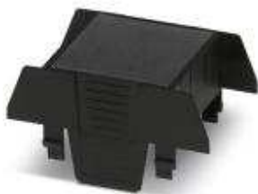
Component housing connection opening on both sides, color: black, width: 45 mm

Please be informed that the data shown in this PDF Document is generated from our Online Catalog. Please find the complete data in the user's documentation. Our General Terms of Use for Downloads are valid ( http://phoenixcontact.com/download )