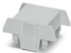
Component housing connection opening on both sides, color: gray, width: 45 mm

Please be informed that the data shown in this PDF Document is generated from our Online Catalog. Please find the complete data in the user's documentation. Our General Terms of Use for Downloads are valid ( http://phoenixcontact.com/download )