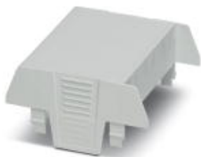
Component housing connection opening on one side, color: gray, width: 67.5 mm

Please be informed that the data shown in this PDF Document is generated from our Online Catalog. Please find the complete data in the user's documentation. Our General Terms of Use for Downloads are valid ( http://phoenixcontact.com/download )