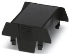
Component housing connection opening on both sides, color: black, width: 67.5 mm

Please be informed that the data shown in this PDF Document is generated from our Online Catalog. Please find the complete data in the user's documentation. Our General Terms of Use for Downloads are valid ( http://phoenixcontact.com/download )