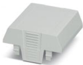
Component housing without connection opening, color: gray, width: 67.5 mm

Please be informed that the data shown in this PDF Document is generated from our Online Catalog. Please find the complete data in the user's documentation. Our General Terms of Use for Downloads are valid ( http://phoenixcontact.com/download )