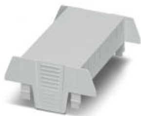
Component housing connection opening on both sides, color: gray, width: 90 mm

Please be informed that the data shown in this PDF Document is generated from our Online Catalog. Please find the complete data in the user's documentation. Our General Terms of Use for Downloads are valid ( http://phoenixcontact.com/download )