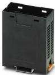
Component housing, color: black, width: 52.5 mm

Please be informed that the data shown in this PDF Document is generated from our Online Catalog. Please find the complete data in the user's documentation. Our General Terms of Use for Downloads are valid ( http://phoenixcontact.com/download )