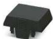
Component housing without connection opening, color: black, width: 52.5 mm

Housing cover - EH 52,5-C CS/ABS BK9005 - 2200336