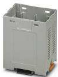
Component housing, color: gray, width: 52.5 mm

Please be informed that the data shown in this PDF Document is generated from our Online Catalog. Please find the complete data in the user's documentation. Our General Terms of Use for Downloads are valid ( http://phoenixcontact.com/download )