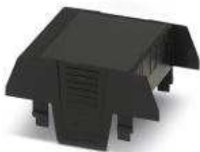
Component housing connection opening on one side, color: black, width: 52.5 mm

Please be informed that the data shown in this PDF Document is generated from our Online Catalog. Please find the complete data in the user's documentation. Our General Terms of Use for Downloads are valid ( http://phoenixcontact.com/download )