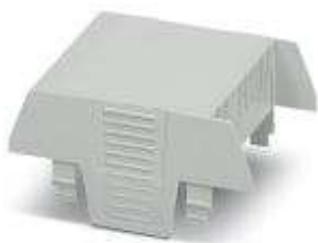
Component housing connection opening on one side, color: gray, width: 52.5 mm

Please be informed that the data shown in this PDF Document is generated from our Online Catalog. Please find the complete data in the user's documentation. Our General Terms of Use for Downloads are valid ( http://phoenixcontact.com/download )