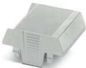
Component housing connection opening on one side, color: gray, width: 70 mm

Please be informed that the data shown in this PDF Document is generated from our Online Catalog. Please find the complete data in the user's documentation. Our General Terms of Use for Downloads are valid ( http://phoenixcontact.com/download )