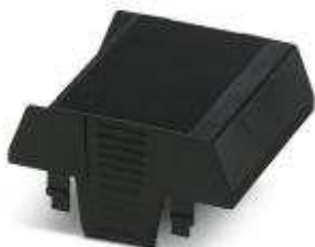
Component housing connection opening on one side, color: black, width: 70 mm

Please be informed that the data shown in this PDF Document is generated from our Online Catalog. Please find the complete data in the user's documentation. Our General Terms of Use for Downloads are valid ( http://phoenixcontact.com/download )