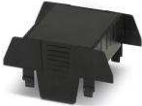
Component housing connection opening on both sides, color: black, width: 52.5 mm

Please be informed that the data shown in this PDF Document is generated from our Online Catalog. Please find the complete data in the user's documentation. Our General Terms of Use for Downloads are valid ( http://phoenixcontact.com/download )