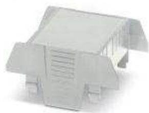
Component housing connection opening on both sides, color: gray, width: 52.5 mm

Please be informed that the data shown in this PDF Document is generated from our Online Catalog. Please find the complete data in the user's documentation. Our General Terms of Use for Downloads are valid ( http://phoenixcontact.com/download )