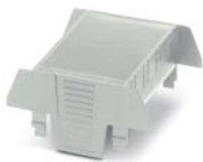
Component housing connection opening on both sides, color: gray, width: 70 mm

Please be informed that the data shown in this PDF Document is generated from our Online Catalog. Please find the complete data in the user's documentation. Our General Terms of Use for Downloads are valid ( http://phoenixcontact.com/download )