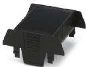
Component housing connection opening on both sides, color: black, width: 70 mm

Please be informed that the data shown in this PDF Document is generated from our Online Catalog. Please find the complete data in the user's documentation. Our General Terms of Use for Downloads are valid ( http://phoenixcontact.com/download )