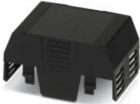
Component housing without connection opening, color: black, width: 45 mm

Please be informed that the data shown in this PDF Document is generated from our Online Catalog. Please find the complete data in the user's documentation. Our General Terms of Use for Downloads are valid ( http://phoenixcontact.com/download )