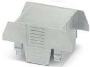
Component housing connection opening on both sides, color: gray, width: 45 mm

Please be informed that the data shown in this PDF Document is generated from our Online Catalog. Please find the complete data in the user's documentation. Our General Terms of Use for Downloads are valid ( http://phoenixcontact.com/download )