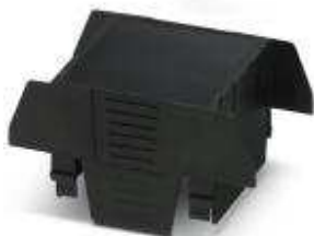
Component housing connection opening on both sides, color: black, width: 45 mm

Please be informed that the data shown in this PDF Document is generated from our Online Catalog. Please find the complete data in the user's documentation. Our General Terms of Use for Downloads are valid ( http://phoenixcontact.com/download )