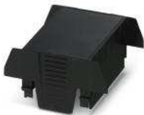
Component housing connection opening on both sides, color: black, width: 67.5 mm

Please be informed that the data shown in this PDF Document is generated from our Online Catalog. Please find the complete data in the user's documentation. Our General Terms of Use for Downloads are valid ( http://phoenixcontact.com/download )