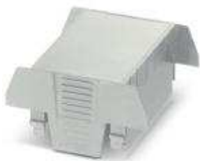
Component housing connection opening on both sides, color: gray, width: 67.5 mm

Please be informed that the data shown in this PDF Document is generated from our Online Catalog. Please find the complete data in the user's documentation. Our General Terms of Use for Downloads are valid ( http://phoenixcontact.com/download )