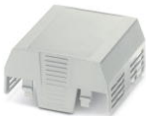
Component housing without connection opening, color: gray, width: 67.5 mm

Please be informed that the data shown in this PDF Document is generated from our Online Catalog. Please find the complete data in the user's documentation. Our General Terms of Use for Downloads are valid ( http://phoenixcontact.com/download )