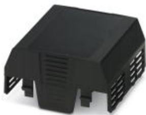
Component housing without connection opening, color: black, width: 67.5 mm

Please be informed that the data shown in this PDF Document is generated from our Online Catalog. Please find the complete data in the user's documentation. Our General Terms of Use for Downloads are valid ( http://phoenixcontact.com/download )