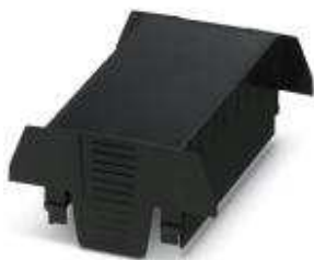
Component housing connection opening on both sides, color: black, width: 90 mm

Please be informed that the data shown in this PDF Document is generated from our Online Catalog. Please find the complete data in the user's documentation. Our General Terms of Use for Downloads are valid ( http://phoenixcontact.com/download )