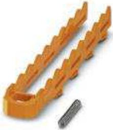
Component housing, Lock and Release system, color: orange, width: 16.2 mm, length: 99 mm

Please be informed that the data shown in this PDF Document is generated from our Online Catalog. Please find the complete data in the user's documentation. Our General Terms of Use for Downloads are valid ( http://phoenixcontact.com/download )