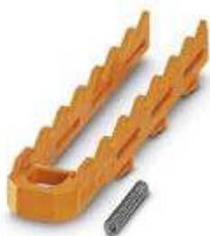
Component housing, Lock and Release system, color: orange, width: 16.2 mm, length: 77 mm

Please be informed that the data shown in this PDF Document is generated from our Online Catalog. Please find the complete data in the user's documentation. Our General Terms of Use for Downloads are valid ( http://phoenixcontact.com/download )