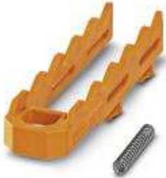
Component housing, Lock and Release system, color: orange, width: 16.2 mm, length: 55 mm

Please be informed that the data shown in this PDF Document is generated from our Online Catalog. Please find the complete data in the user's documentation. Our General Terms of Use for Downloads are valid ( http://phoenixcontact.com/download )