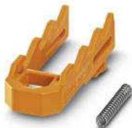
Component housing, Lock and Release system, color: orange, width: 16.2 mm, length: 33 mm

Please be informed that the data shown in this PDF Document is generated from our Online Catalog. Please find the complete data in the user's documentation. Our General Terms of Use for Downloads are valid ( http://phoenixcontact.com/download )