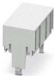
Component housing, Cover, color: light gray, width: 18.9 mm, length: 32.8 mm, height: 12.2 mm

Please be informed that the data shown in this PDF Document is generated from our Online Catalog. Please find the complete data in the user's documentation. Our General Terms of Use for Downloads are valid ( http://phoenixcontact.com/download )