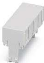
Component housing, Cover, color: light gray, width: 18.9 mm, length: 43.8 mm, height: 12.2 mm

Please be informed that the data shown in this PDF Document is generated from our Online Catalog. Please find the complete data in the user's documentation. Our General Terms of Use for Downloads are valid ( http://phoenixcontact.com/download )