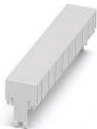
Component housing, Cover, color: light gray, width: 18.9 mm, length: 98.8 mm, height: 12.2 mm

Please be informed that the data shown in this PDF Document is generated from our Online Catalog. Please find the complete data in the user's documentation. Our General Terms of Use for Downloads are valid ( http://phoenixcontact.com/download )