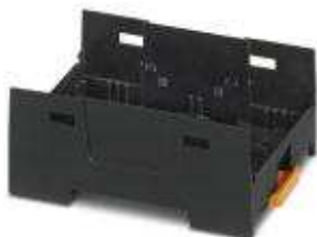
Component housing, color: black, width: 52.5 mm

Please be informed that the data shown in this PDF Document is generated from our Online Catalog. Please find the complete data in the user's documentation. Our General Terms of Use for Downloads are valid ( http://phoenixcontact.com/download )