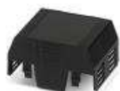
Component housing without connection opening, color: black, width: 52.5 mm

Housing cover - EH 52,5 F-C CS/ABS BK9005 - 2201834