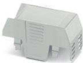
Component housing connection opening on one side, color: gray, width: 35 mm

Please be informed that the data shown in this PDF Document is generated from our Online Catalog. Please find the complete data in the user's documentation. Our General Terms of Use for Downloads are valid ( http://phoenixcontact.com/download )