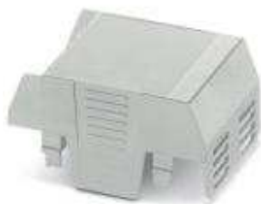
Component housing connection opening on one side, color: gray, width: 52.5 mm

Please be informed that the data shown in this PDF Document is generated from our Online Catalog. Please find the complete data in the user's documentation. Our General Terms of Use for Downloads are valid ( http://phoenixcontact.com/download )