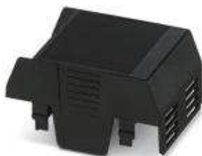
Component housing connection opening on one side, color: black, width: 52.5 mm

Please be informed that the data shown in this PDF Document is generated from our Online Catalog. Please find the complete data in the user's documentation. Our General Terms of Use for Downloads are valid ( http://phoenixcontact.com/download )