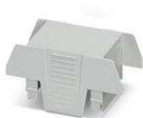
Component housing connection opening on both sides, color: gray, width: 35 mm

Please be informed that the data shown in this PDF Document is generated from our Online Catalog. Please find the complete data in the user's documentation. Our General Terms of Use for Downloads are valid ( http://phoenixcontact.com/download )