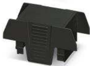
Component housing connection opening on both sides, color: black, width: 35 mm

Please be informed that the data shown in this PDF Document is generated from our Online Catalog. Please find the complete data in the user's documentation. Our General Terms of Use for Downloads are valid ( http://phoenixcontact.com/download )