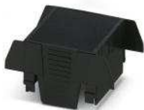
Component housing connection opening on both sides, color: black, width: 52.5 mm

Please be informed that the data shown in this PDF Document is generated from our Online Catalog. Please find the complete data in the user's documentation. Our General Terms of Use for Downloads are valid ( http://phoenixcontact.com/download )