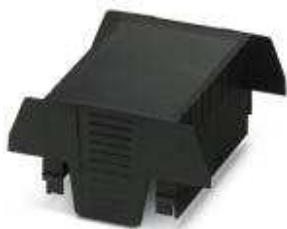
Component housing connection opening on both sides, color: black, width: 70 mm

Please be informed that the data shown in this PDF Document is generated from our Online Catalog. Please find the complete data in the user's documentation. Our General Terms of Use for Downloads are valid ( http://phoenixcontact.com/download )