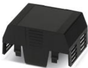
Component housing without connection opening, color: black, width: 52.5 mm

Please be informed that the data shown in this PDF Document is generated from our Online Catalog. Please find the complete data in the user's documentation. Our General Terms of Use for Downloads are valid ( http://phoenixcontact.com/download )