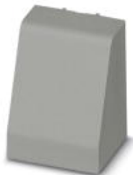
Component housing, color: gray

Please be informed that the data shown in this PDF Document is generated from our Online Catalog. Please find the complete data in the user's documentation. Our General Terms of Use for Downloads are valid ( http://phoenixcontact.com/download )