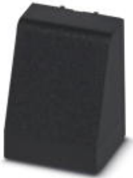
Component housing, color: black

Please be informed that the data shown in this PDF Document is generated from our Online Catalog. Please find the complete data in the user's documentation. Our General Terms of Use for Downloads are valid ( http://phoenixcontact.com/download )