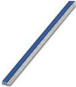
Jumper for PCO power connector in ME-MAX housing, color: blue (similar to RAL 5015)

Please be informed that the data shown in this PDF Document is generated from our Online Catalog. Please find the complete data in the user's documentation. Our General Terms of Use for Downloads are valid ( http://phoenixcontact.com/download )