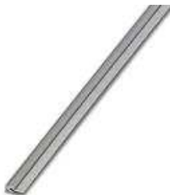
Jumper for PCO power connector in ME-MAX housing, color: gray (similar to RAL 7042)

Please be informed that the data shown in this PDF Document is generated from our Online Catalog. Please find the complete data in the user's documentation. Our General Terms of Use for Downloads are valid ( http://phoenixcontact.com/download )