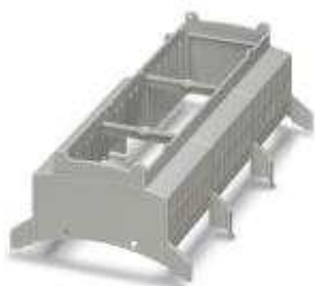
Installation component housing, Upper part, color: light gray, width: 161.6 mm, length: 89.7 mm, height: 62.2 mm

Please be informed that the data shown in this PDF Document is generated from our Online Catalog. Please find the complete data in the user's documentation. Our General Terms of Use for Downloads are valid ( http://phoenixcontact.com/download )