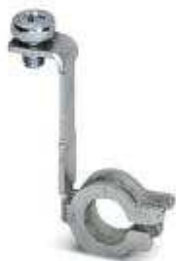
PE contact for UM-BASIC panel mounting base for connecting the PCB to the DIN rail at level 1

Please be informed that the data shown in this PDF Document is generated from our Online Catalog. Please find the complete data in the user's documentation. Our General Terms of Use for Downloads are valid ( http://phoenixcontact.com/download )