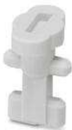
Locking element for locking the PCB onto UM-BASIC/PRO housing at level 3

Please be informed that the data shown in this PDF Document is generated from our Online Catalog. Please find the complete data in the user's documentation. Our General Terms of Use for Downloads are valid ( http://phoenixcontact.com/download )