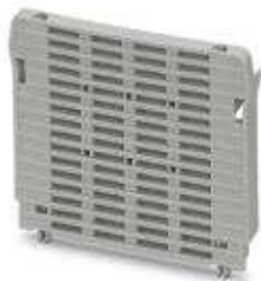
Panel mounting base, color: light gray

Please be informed that the data shown in this PDF Document is generated from our Online Catalog. Please find the complete data in the user's documentation. Our General Terms of Use for Downloads are valid ( http://phoenixcontact.com/download )