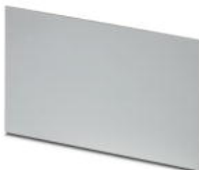
Panel mounting base, Front plate, color: aluminum color, width: 101.8 mm, length: 990 mm, height: 2 mm

Please be informed that the data shown in this PDF Document is generated from our Online Catalog. Please find the complete data in the user's documentation. Our General Terms of Use for Downloads are valid ( http://phoenixcontact.com/download )